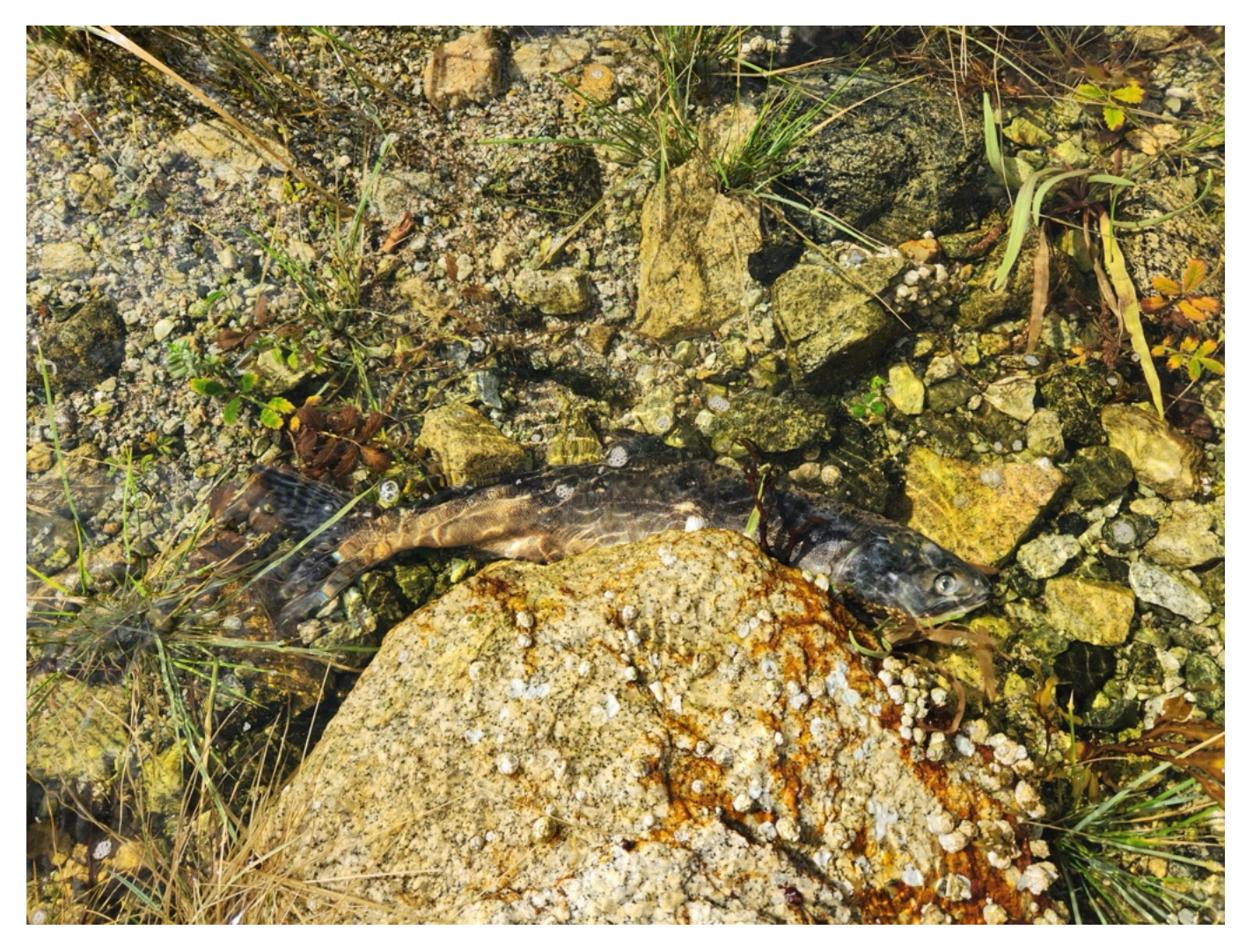
Photo #174 - Image associated with AWC Observation Detail M-AWC-DETAIL-1125