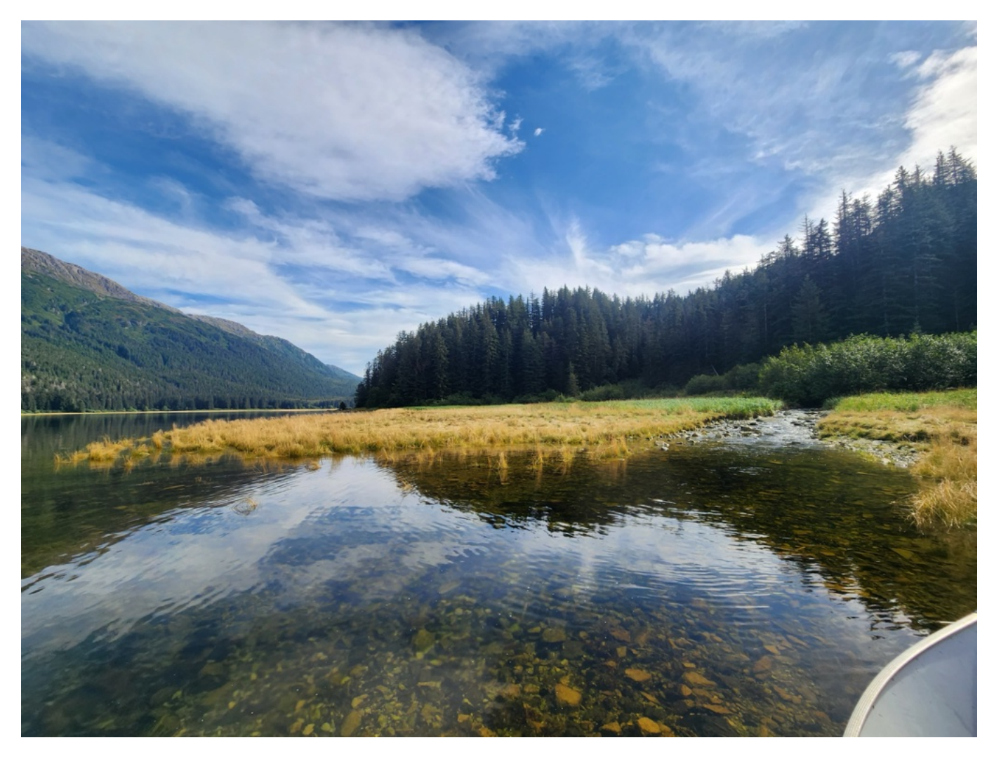
Photo #168 - Image associated with AWC Observation Detail M-AWC-DETAIL-1125