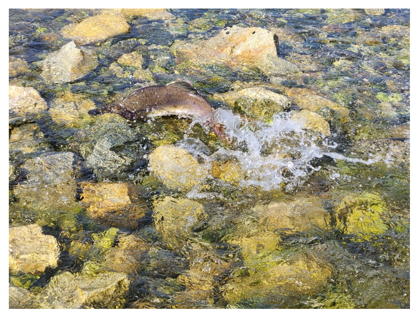
Photo #172 - Image associated with AWC Observation Detail M-AWC-DETAIL-1125