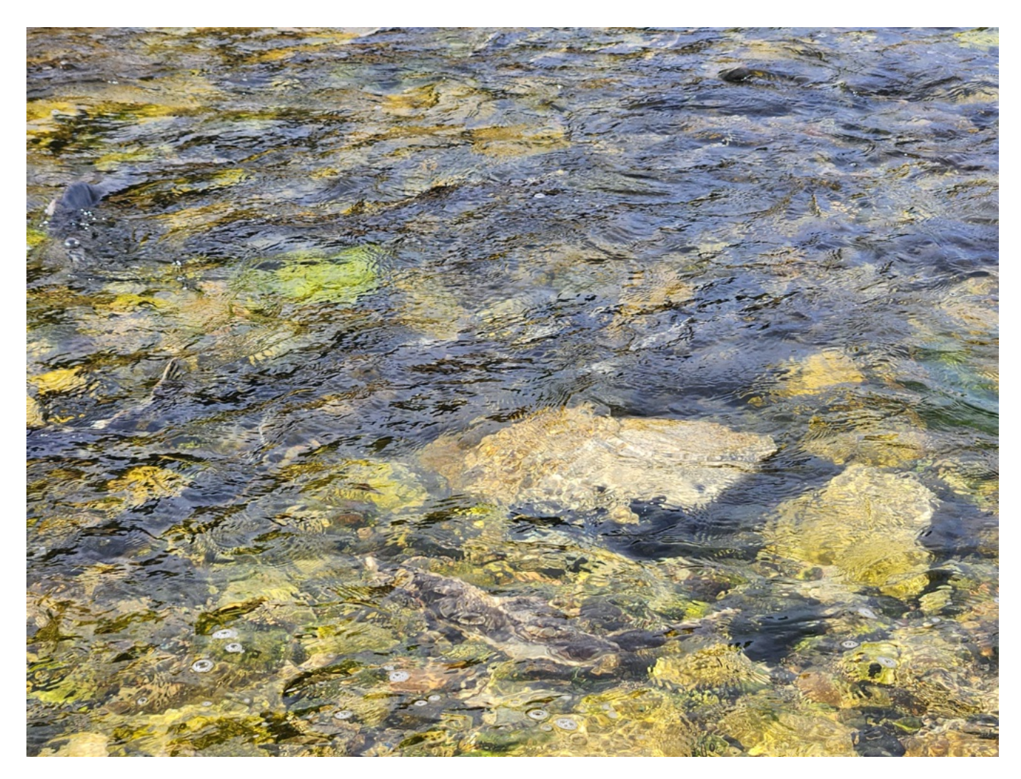
Photo #173 - Image associated with AWC Observation Detail \underline{\text{M-AWC-DETAIL-1125}}