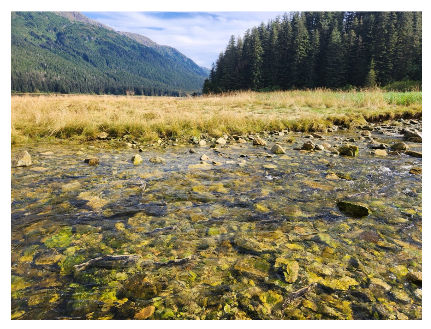
Photo #170 - Image associated with AWC Observation Detail M-AWC-DETAIL-1125